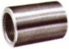
NPT REDUCING COUPLING