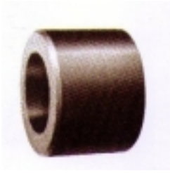
SW HALF COUPLING