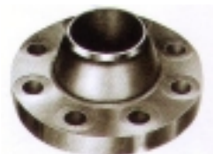
WELDING NECK FLANGES