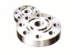
RING JOINT FLANGES