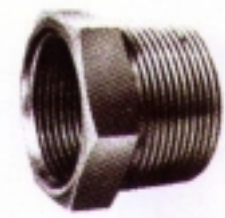
NPT HEX BUSHING