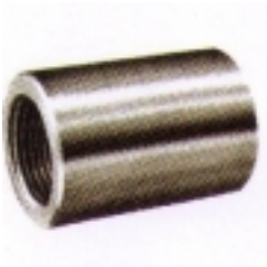
SW REDUCING COUPLING