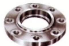
SOCKET WELDING FLANGES