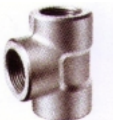
NPT REDUCING TEE