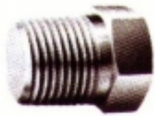
NPT HEX PLUG