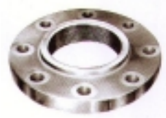
THREADED (SCREWED) FLANGES