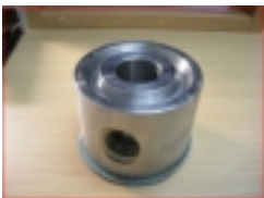
RTJ BLEED RING