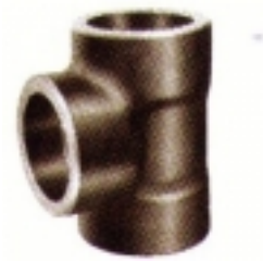
SW REDUCING TEE